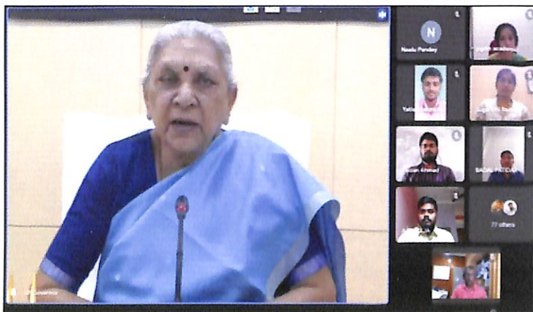
The Honorable Governor of Uttar Pradesh, Smt. Anandiben Patel addressing the students of PGDM (ABM) during the inaugural function through online mode.

The inaugural function of 14 th PGDM (ABM) was held on 20 th July, 2021 at RICM, Gandhinagar. The Honorable Governor of Uttar Pradesh, Smt. Anandiben Patel was the Chief Guest of the inaugural Function. During the inaugural address Smt. Anandiben Patel, Honorable Governor of Uttar Pradesh motivated PGDM (ABM) students for their higher study. RICM admitted 45 students in the PGDM (ABM)