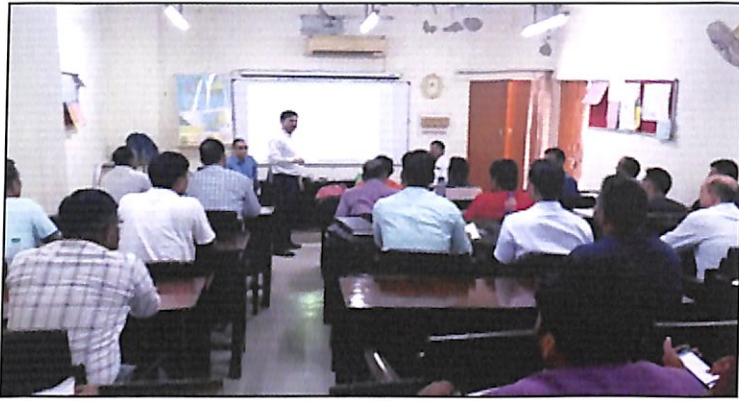
A view of the participants of the Certificate Course in Financial Accounting System commenced from 31.8.2021 at ICM, Lucknow