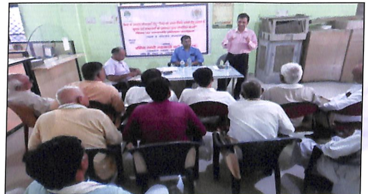
Glimpses of Training Programme for Districts of Uttar Pradesh under SOFTCOB Scheme of NABARD for the Secretary of PACS.