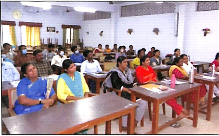
A view of the Valedictory Function of 46 th Higher Diploma in Cooperative Management was held on 23 rd July 2021