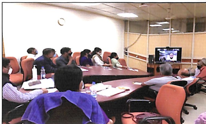
Directors/faculty members of training units deliberating upon the women/gender-based activities carried out by their respective training institutes.