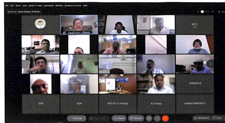
A view of the panelists and participants of High Level National Webinar on Inclusive and Sustainable Post Pandemic recovery of Agricultural Sector in India.