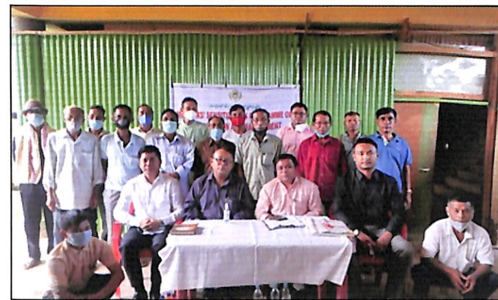
A Group Photo of participants along with Director (i/c) and Prog. Coordinator