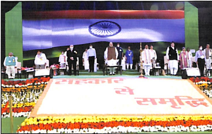
A view of the National Cooperative Conference held on 25th September, 2021

Hon'ble Union Minister of Cooperation, Shri Amit Shah on 25 th September, 2021 during the National Conference on Cooperatives organized by IFFCO on the occasion of 75 years of Independence, congratulated the people of India for creation of new Ministry of Cooperation. Getting pride of being 1 st Union Cooperation Minister, the Hon'ble Minister encouraged people of India by strengthening and giving proper direction to the Cooperative Movement in India for growth of economy through cooperatives. Hon'ble Minister during the Conference declared to formulate the New National Cooperative Policy for India and also an object of preparing a proper legal blue print to increase the number of PACS from 65,000 to 3,00,000. The Hon'ble Minister has also announced to establish the National Cooperative University which will be the first and foremost of its kind and also to set up Common Service Centres for Cooperatives in India.