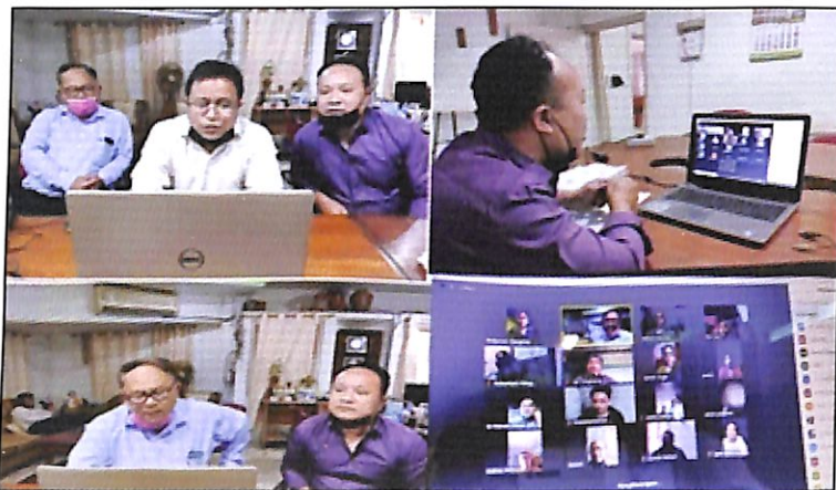
A view of the Inaugural Function of 33 rd Session of HDCM on 26 th July 2021 through online mode

The Institute organised the Inaugural Function of 33 rd Session of 26 weeks Higher Diploma in Cooperative Management (HDCM) on 26 th July 2021 through online mode. Altogether 26 officers from the Department of Cooperation, Government of Manipur participated in the HDCM programme.