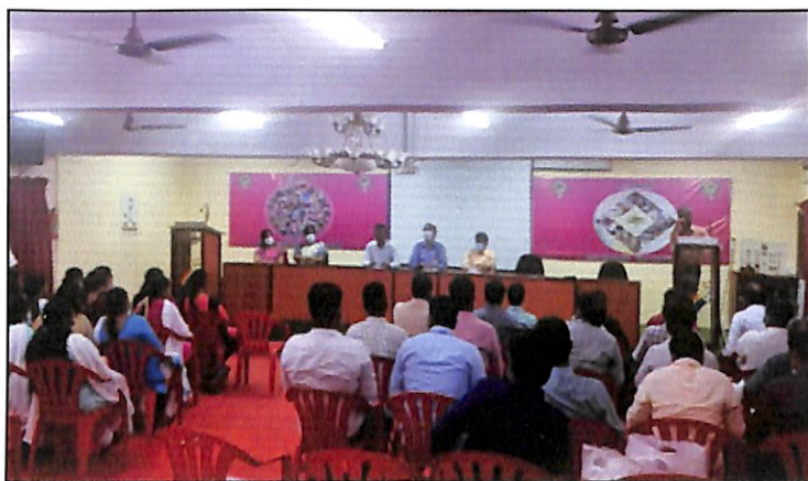
Sectoral Diploma - 45 th Session Diploma in Industrial Cooperative Management, Commenced at our NICM, Chennai on 07.07.2021