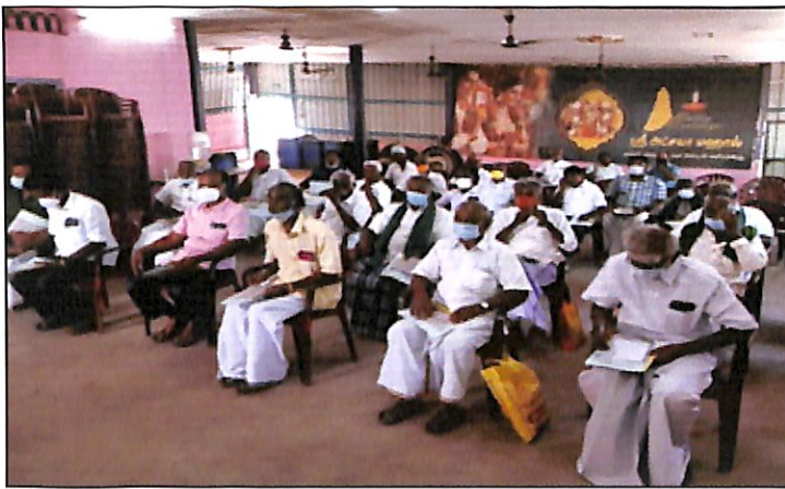
A view of One day Awareness Programme for the Paddy and Coconut Growing Farmers, Traders and Millers organised by ICM, Madurai in collaboration with WDRA at Singampunari, Sivagangai District on 4.8.2021