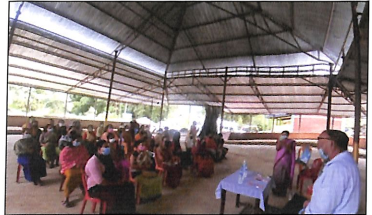
A view of the participants

ICM Imphal organised One Day Awareness Programme on Management of SHGs for Formation of Cooperatives on 04-09-2021 at Khurkhul, Imphal West District, Manipur. Altogether 25 Scheduled Caste women representatives of different SHGs of Khurkhul participated in the Programme.