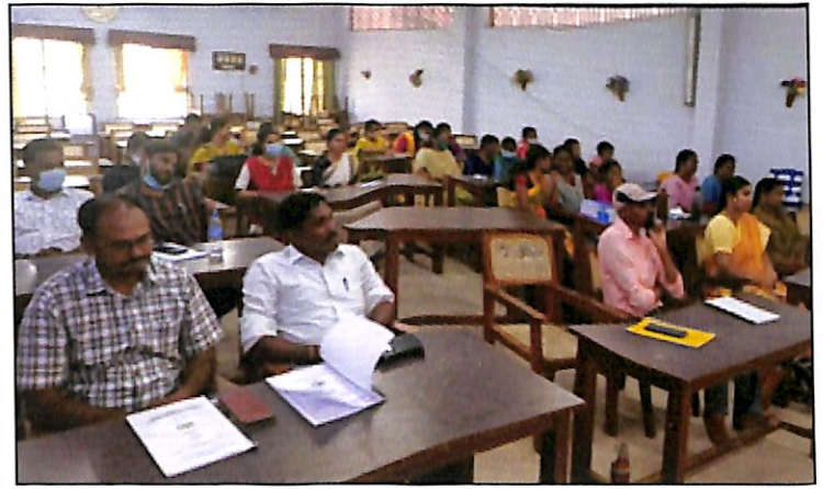
A view of the valedictory function of 47 th Higher Diploma in Cooperative Management (HDCM) was held on 30 th July 2021