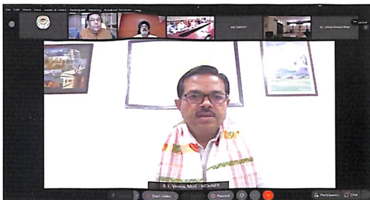
Shri B.L. Verma, Hon’ble Minister of State for Cooperation, GOI, addressing the participants during the inaugural function of High Level National Webinar on “Resilient Indian Dairy Cooperatives – Exploring the Challenges and Opportunities”

A High Level National Webinar on “Resilient Indian Dairy Cooperatives – Exploring the Challenges and Opportunities” was convened by NCCT on 30 th July, 2021. Shri B.L. Verma, Hon’ble Minister of State for Cooperation, GOI, graced the webinar event with his presence as Chief Guest. The sessions were on significant deliberations by eminent speakers on various topics of Dairy sector.