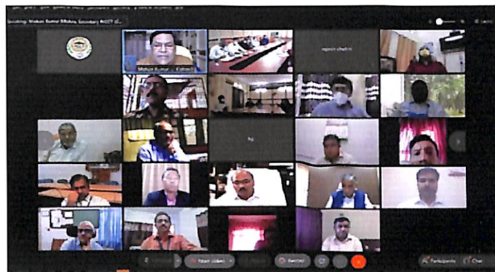
A view of the Webinar on “Resilient Indian Dairy Cooperatives – Exploring the Challenges and Opportunities”