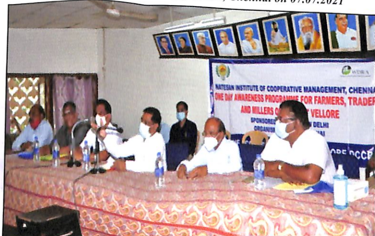
A view of the one day Farmers Awareness Programme conducted at Vellore District on 31.08.2021