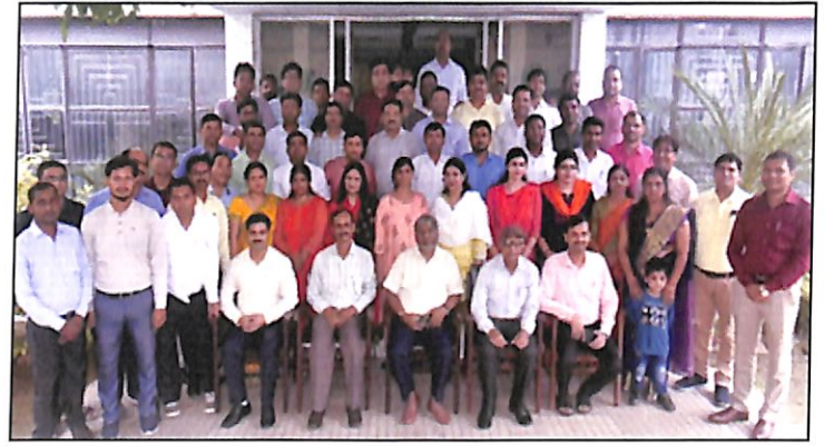
A Group Photo of the Training Programme organised by ICM, Lucknow for the Assistant Development Officers of Uttar Pradesh State Cooperative Department recruited through Uttar Pradesh Public Service Commission from 13-09-2021 to 12-10-2021.