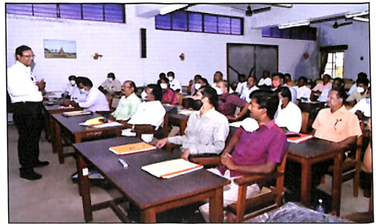
A view of one day "Trainers Training Programme" conducted by ICM, Madurai on 28.8.2021 for the various department officials of CSR/MD.DCU & CPO /Manager/ Assistants of Tamilnadu Cooperative Union