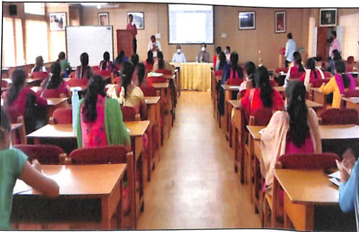
A view of the programme conducted on Kayaka Mithra for the members of SIRD, Mysore from 5.8.2021 to 11.8.2021