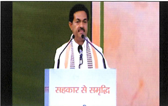
Shri B.L. Verma, Hon'ble Minister of State for Cooperation, GOI, addressing the participants during the National Cooperative Conference