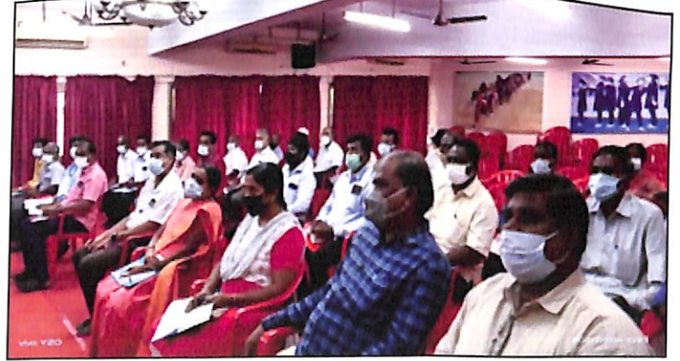
View of the Awareness Programmes on WDRA Act, 2007 for Farmers, businessmen & millers of different districts of Uttar Pradesh on WDRA Act, 2007 organised by ICM, Lucknow in collaboration with WDRA, New Delhi