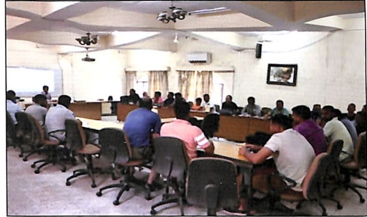
टैली का उपयोग करके बुक कीपिंग और अकाउंटिंग पर कार्यक्रम का एक दृश्य

से “Book Keeping and Accounting using Tally दिनांक 31.8.21 से 20.11.21 एवं Diploma in Industrial Cooperative Management” दिनांक 6.9.21 से 26.11.21 तक रक्षा मंत्रालय के कार्मिकों हेतु प्रशिक्षण कार्यक्रम आयोजित किए जा रहे हैं। उपरोक्त दोनों प्रशिक्षण कार्यक्रमों में क्रमशः 35 व 40 प्रतिभागी शामिल है।