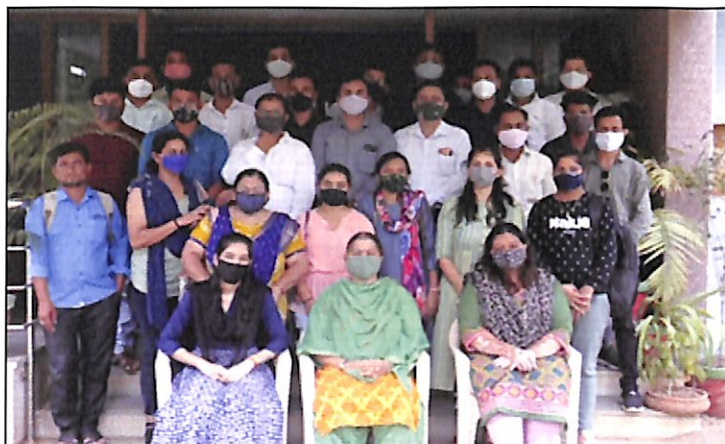
A Group photo of the participants of the 3 rd Higher Diploma in Cooperative Management online course commenced on 12 th July, 2021