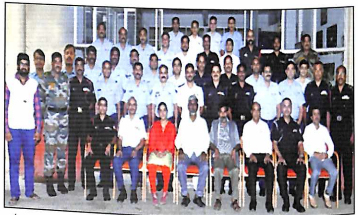
A group photo of the Certificate Course in Book- Keeping and Using Tally for DGR from 20.09.2021 to 10.12.2021.