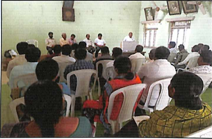
Programme on 'How to do existing business better in Post Reform Scenario' under SOFTCOB, NABARD, during 15 – 18 November 2021 organised by ICM, Nagpur