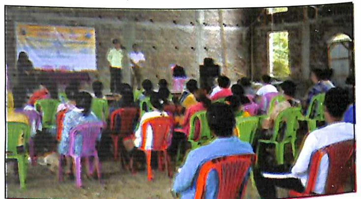
A view of the Awareness Programme on PMEGP

ICM Imphal conducted One Day Awareness Programme on PMEGP on 28 th October 2021 at Aimol Khullen, Tengoupal District, Manipur . Altogether 39 ST entrepreneurs participated in the training programme.