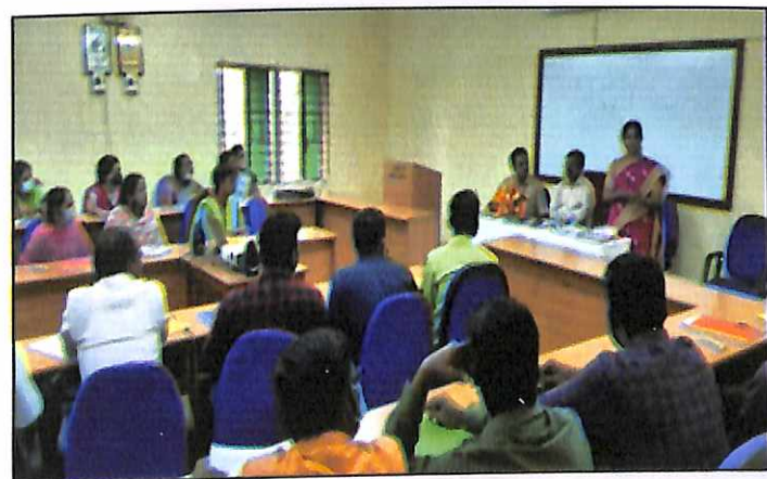
Online Member Education and Awareness Programme on Cooperation for Falotpadan Va Krushi Karmachari Sahakari Patasanstha Maryadit, Nagpur organised by ICM, Nagpur on 23.10.21