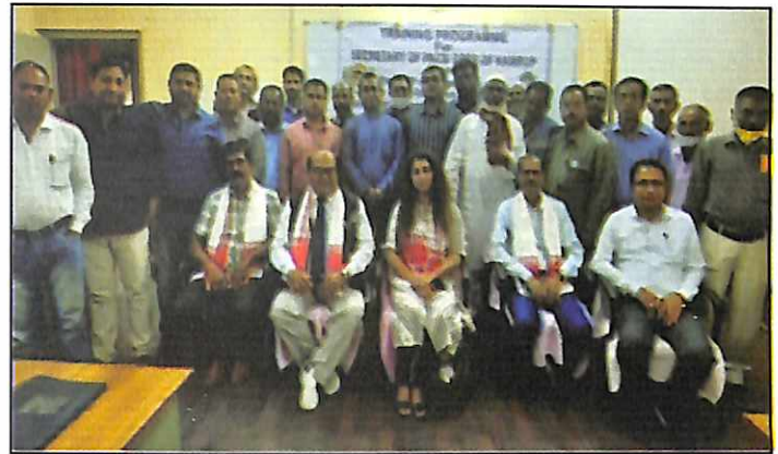
Training Programme on CAS-MIS conducted by ICM, Guwahati from 6 th to 18 th November, 2021 sponsored by NABARD Regional Office Guwahati under SOFTCOB Scheme