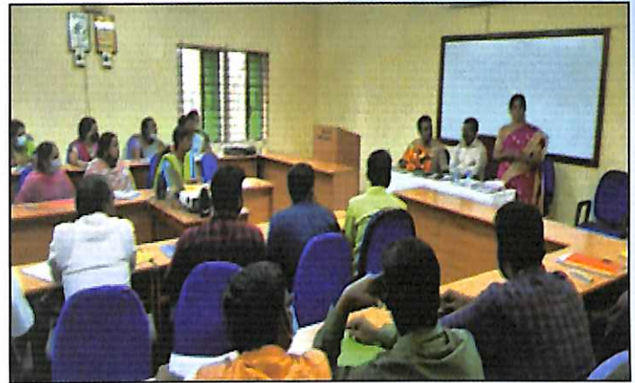
Induction Training Programme for the newly recruited Assistants of Tamil Nadu Cooperative State Agriculture & Rural Development Bank organised by ICM, Madurai from 6.10.2021 to 8.10.2021 sponsored by ICDDP, Chennai