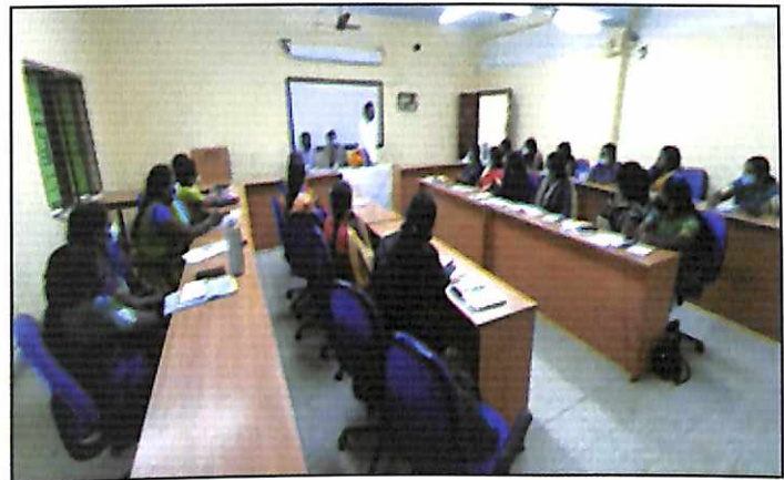
Women Empowerment Training Programme organised by ICM, Madurai from 15.11.21 to 17.11.21 for the women officers of CCBS/UCBs.