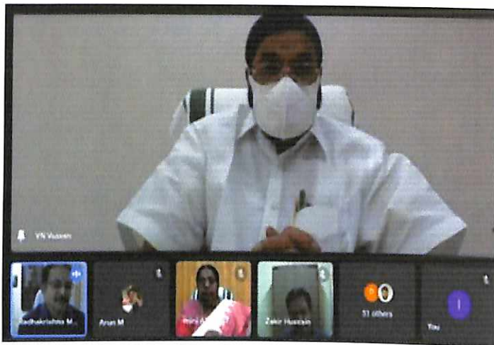
Shri. V.N.Vasava, Hon. Minister for Cooperation, Govt. of Kerala inaugurating the Workshop on Youth Cooperatives

ICM, Thiruvananthapuram conducted a three days Online Workshop on Youth Cooperatives during 11-13 October 2021 for the promoters of newly registered Youth Cooperatives. The focus of the programme is to familiarize them with the Cooperative ideology, Accounts and Entrepreneurship. The programme was