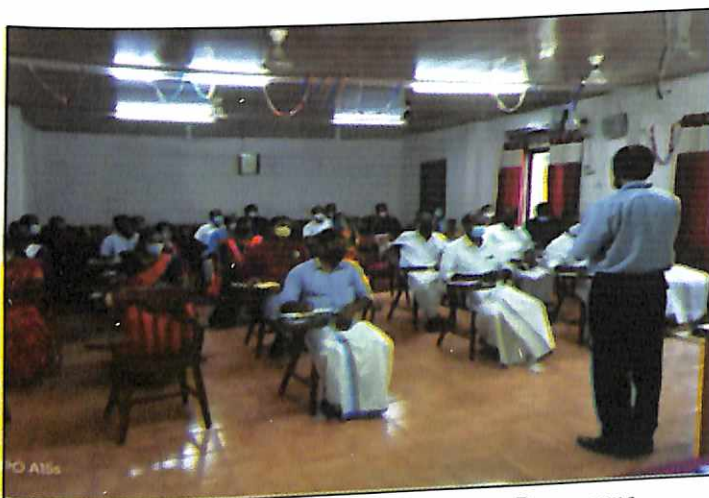
A view of the Management Development Programme

ICM, Kannur organized a one day Managerial Development programme for the BODs and employees of Chengalayi Service Cooperative Bank on 4 th November 2021. 28 participants attended the programme.