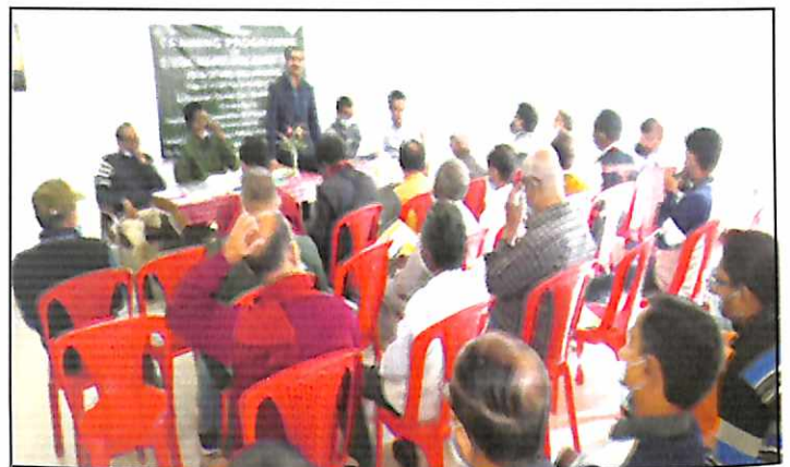
Training Programme on Business Development Plan for Functionaries of PACS/GPSS of Charaideo, Assam, Assam conducted by ICM, Guwahati from 20 th -22 nd December, 2021