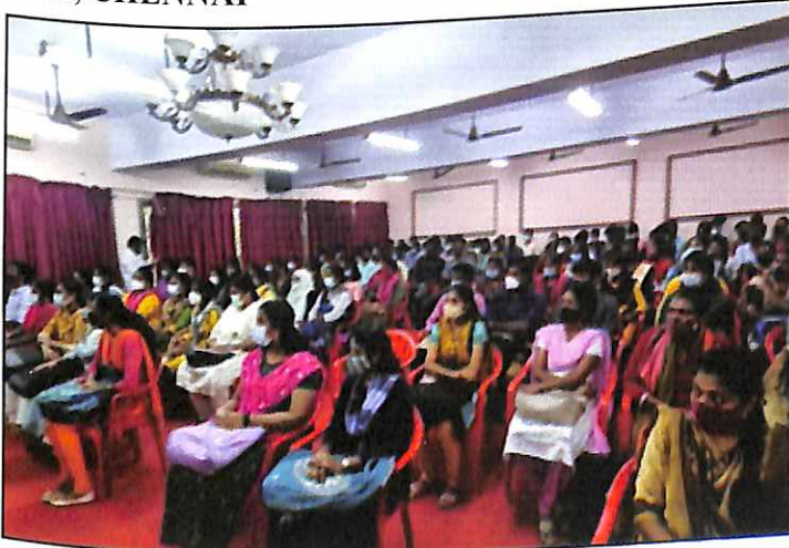
Inauguration of 89 th & 90 th Session of HDCM Private batches