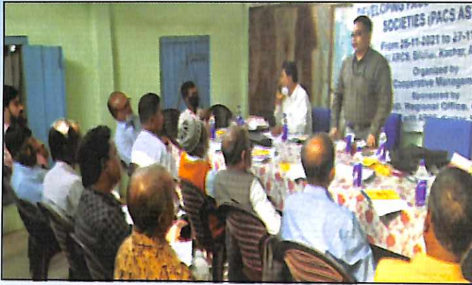
Training Programme on Developing PACS into Multi-purpose Cooperative Societies conducted by ICM, Guwahati at Silchar, Assam from 25 th to 27 th November, 2021 sponsored by NABARD Regional Office, Guwahati under SOFTCOB Scheme