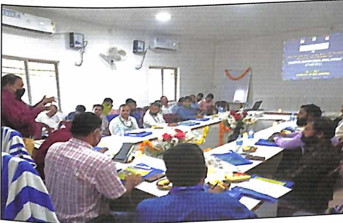
District Level Master Trainers' (DLMT) training programme on implementation of Pradhan Mantri Fasal Bima Yojana (PMFBY) conducted at Jharsugda, Odisha on 3.11.21