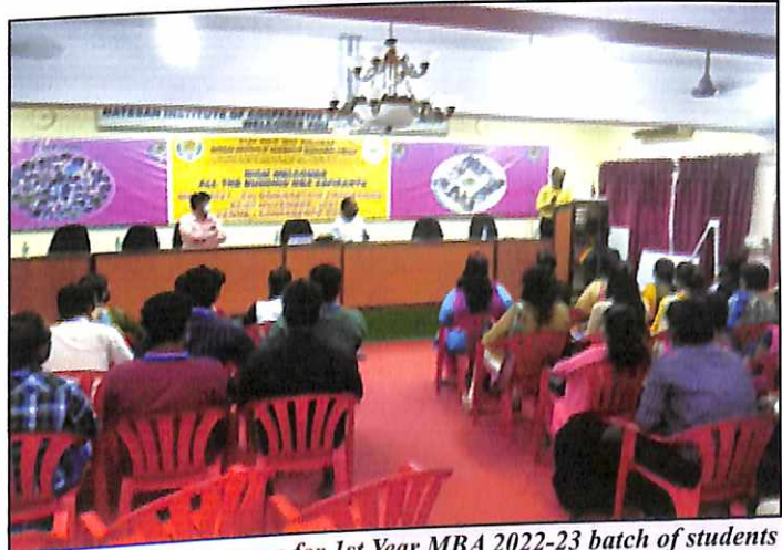
Orientation Programme for 1st Year MBA 2022-23 batch of students