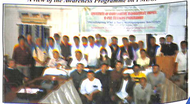
A Group Photo of Participants with Managing Director, MSCB Ltd., President of MSCB Ltd. & Director(i/c), ICM, Imphal