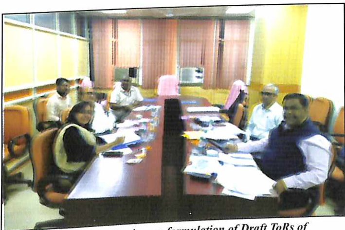
A view of the Meeting on formulation of Draft ToRs of the New National Cooperative Policy

NCCT has been designated by the Ministry of Cooperation, GoI as Nodal Agency for the formulation of New National Cooperative Policy including VAMNICOM, Pune, and Institute of Rural Management, Anand (IRMA) as Knowledge Partner. Two meetings were held on 6.10.2021 and 12.10.21 and Draft ToRs for formulation of New National Cooperative Policy. As part of this prestigious assignment, NCCT, VAMNICOM & IRMA prepared the Draft Terms of References (ToRs) of the New National Cooperative Policy and submitted to the Secretary (Cooperation), GoI, Ministry of Cooperation on 13 th October, 2021.