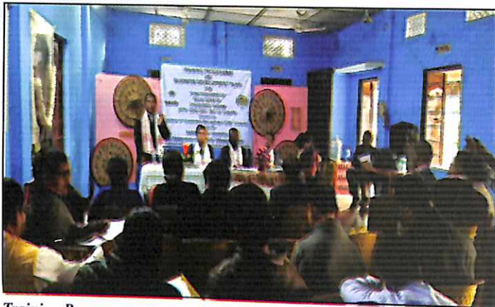
Training Programme on Business Development Plan for Functionaries of PACS/GPSS of Charaideo, Assam, Assam conducted by ICM, Guwahati from 20 th -22 nd December, 2021