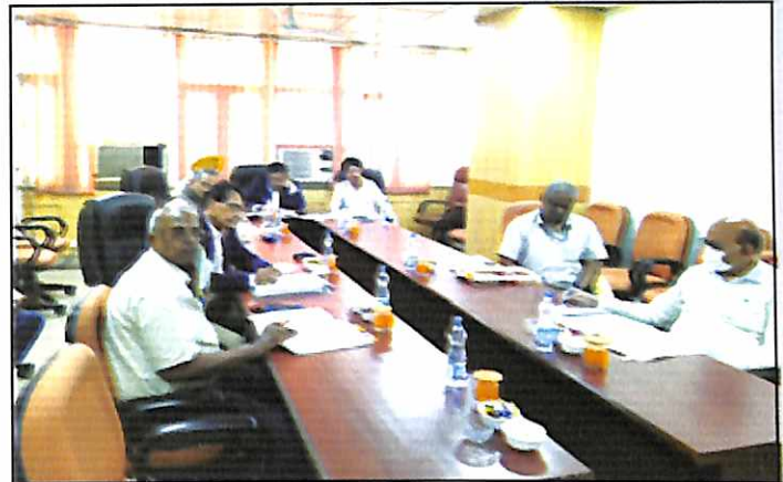
A view of the meeting on preparation of Model Bye-laws for PACS

The decision taken in the Ministry's Senior Officers Meeting held on 22.10.21 under the chairmanship of Secretary, Ministry of Cooperation, the preparation of the Model Bye-laws was assigned to NCCT and VAMNICOM. A Committee has been constituted at the NCCT level and the work is in progress in finalizing the Model Bye-laws for PACS.