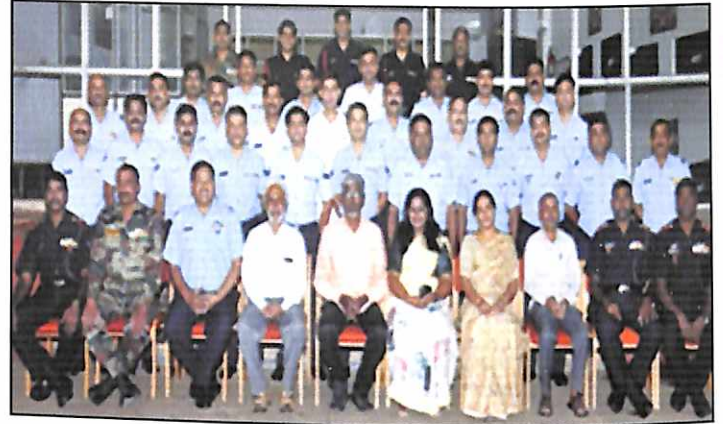
A group photo of the Certificate Course in Retail Team Leader for DGR from 31.08.2021 to 20.11.2021.