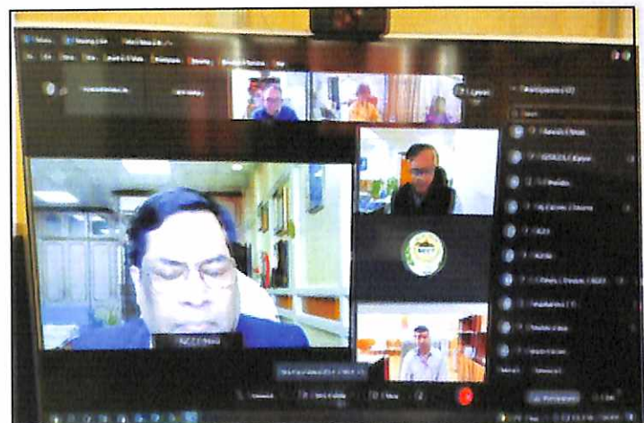
A view of the VC Meeting under the chairmanship of Secretary, Ministry of Cooperation, GoI

A Video Conferencing was held on 2.11.21 and 22.11.21 under the chairmanship of Secretary, Ministry of Cooperation with Directors of ICMs/RICMs/VAMNICOM. The Chairperson interacted with the Directors of the units of NCCT and discussed about the suggestion for improvement of quality training, Coordination with State Cooperative Training Institutes, Improvement of training infrastructure and IT related initiative, increasing revenue flow for RICMs/ICMs, Activating defunct PACS, Creating new PACS in unserved areas, Transformation of PACS into multi service entities.