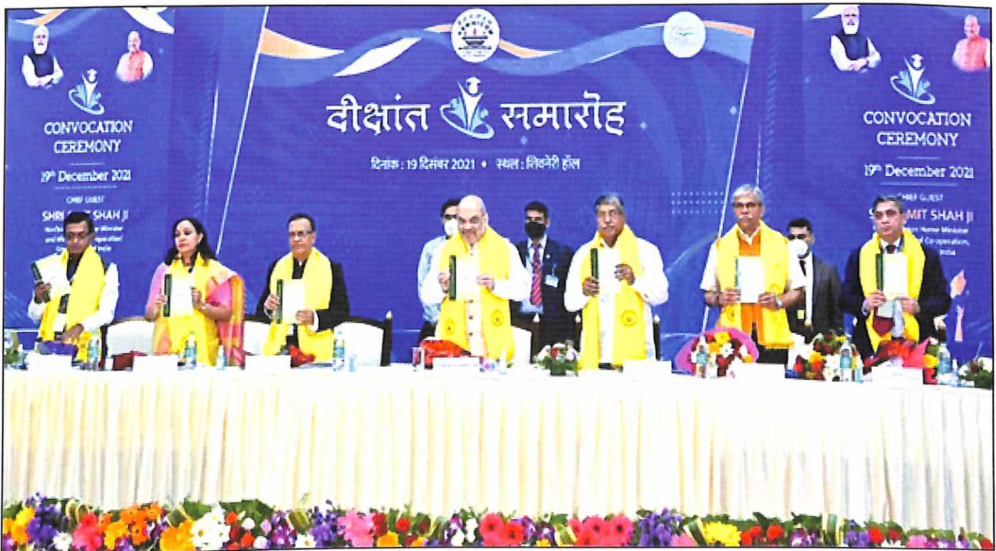
Shri Amit Shah ji, Hon'ble Union Home Minister and Minister of Cooperation, Government of India releasing the Journal "Cooperative Perspective" during the Convocation Ceremony, 2021

During the convocation address, Hon'ble Minister of Cooperation, Shri Amit Shah ji stressed upon the importance of agribusiness and cooperative education in the overall development agenda of the country. He congratulated all the students on