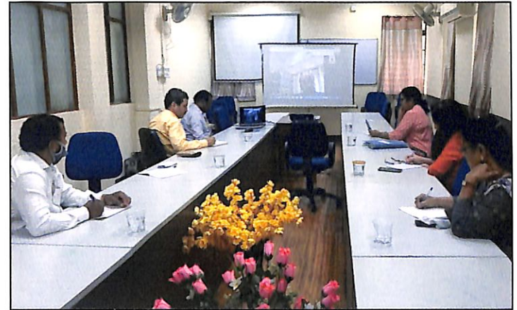
ऑनलाइन कार्यशाला का एक दृश्य