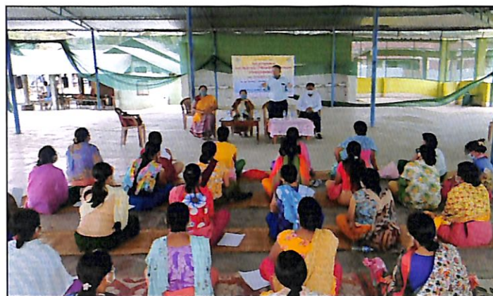
A view of the participants of Farmers Training Programme on Rice Cultivation at Awang Potshangbam, Imphal West (with social distancing)