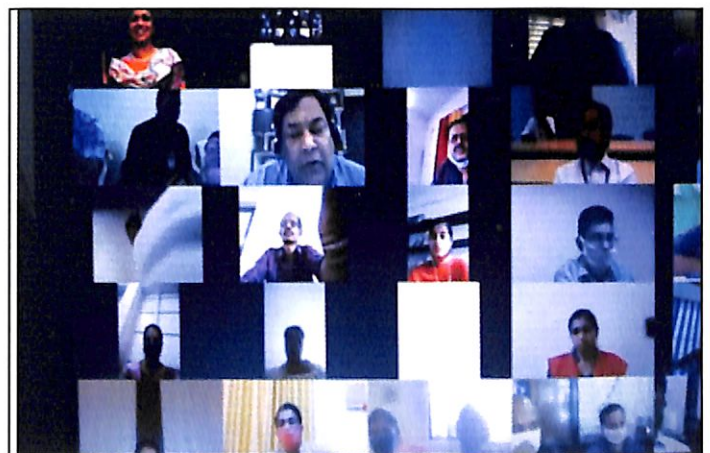
Online Career Development Programme