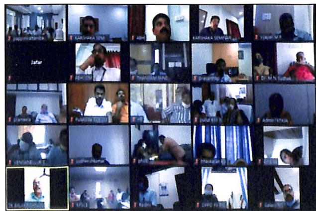
Webinar on PACS