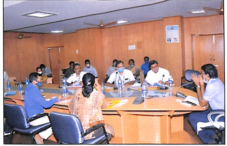
Director I/c, ICM, Madurai presented DPR in the DLCC of Tiruppur District Chaired by the District Collector