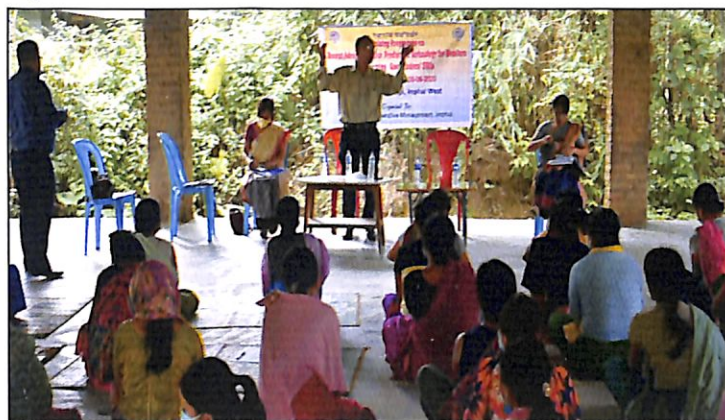
A view of the participants of Farmers Training Programme on Rice Cultivation at Tairenpokpi, Imphal West (with social distancing)

The Institute organized two outstation Programme on Recent Advances in Rice Production Technology for the Members of Farming Cooperatives/SHGs especially for ST categories by following social distancing norms at Tairenpokpi, Imphal West, Imphal from 25.06.2020 to 26.06.2020 and at Awang Potshangbam, Imphal from 26.06.2020 to 27.06.2020.