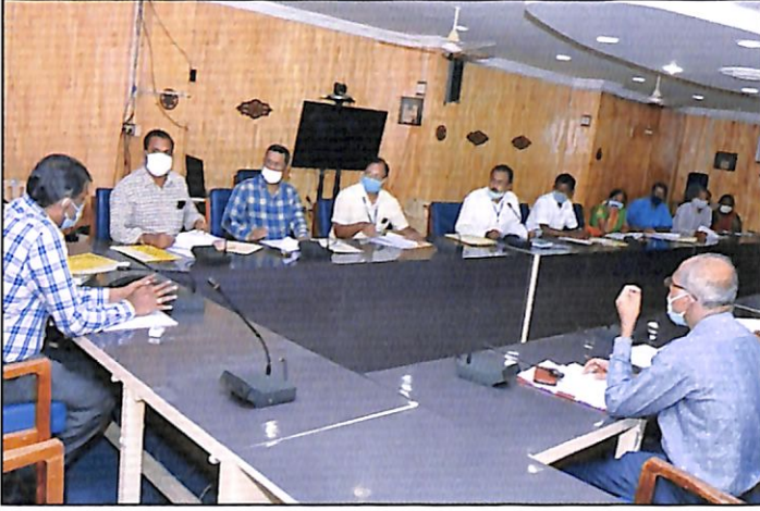
Director I/c, ICM, Madurai presenting the DPR in the DLCC of Virudhunagar District, Tamil Nadu Chaired by the District Collector

The Director I/c, ICM, Madurai presented the DPR in the DLCCs of Virudhunagar District, Tiruppur District and Thiruvannamalai District chaired by the respective District Collector on 22.05.2020, 27.05.2020 and 17.06.2020 respectively.