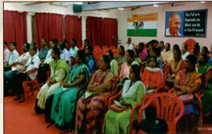
Glimpses of ICDP Programme on Retail Management & Customer Service