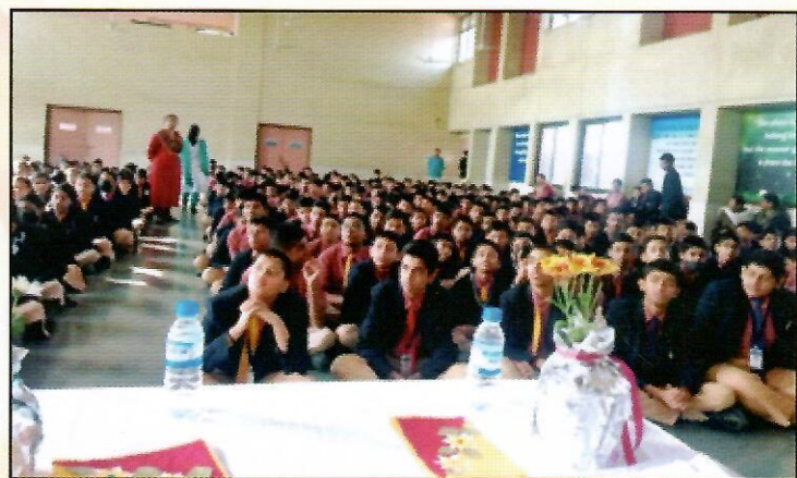
Glimpses of Cooperative Awareness Programme under Azadi ka Amrut Mahotsav at St. Xaviers High School.