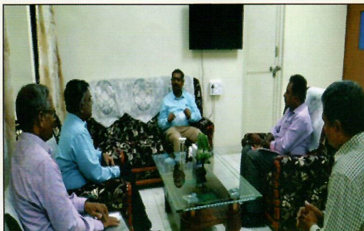
Glimpses of Academic Council Meeting conducted at NICM, Chennai