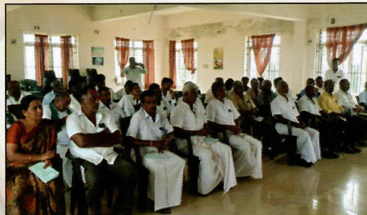
Glimpses of One Day Awareness Programme for the Paddy and Coconut Growing Farmers and Millers