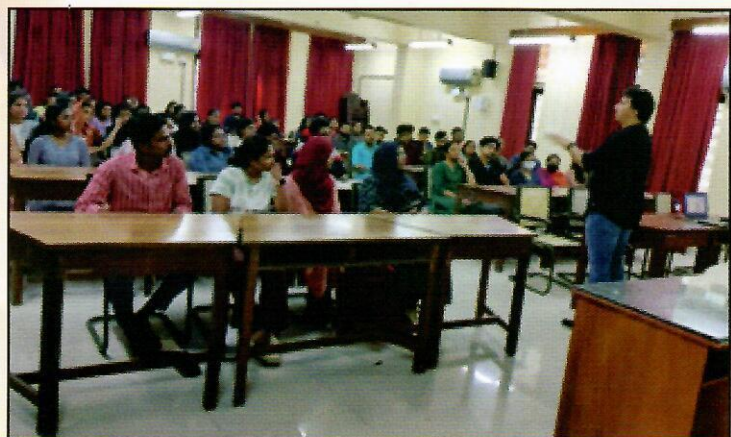
Glimpses of Guest talk on Digital Marketing