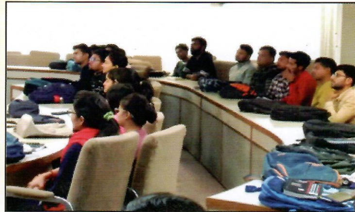
Glimpses of Cooperative Awareness Training programme for the students of different Institutes/Colleges under the scaling up programme.