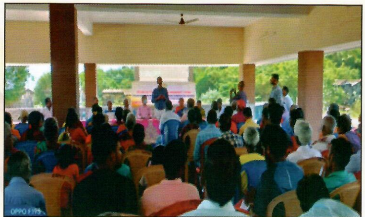
Glimpses of the Scaling up Training Programme for Members of Fisheries Cooperative Societies