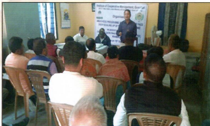
Glimpses of the Training Programme at Pachim Bonbhag, PACS, Nalbari