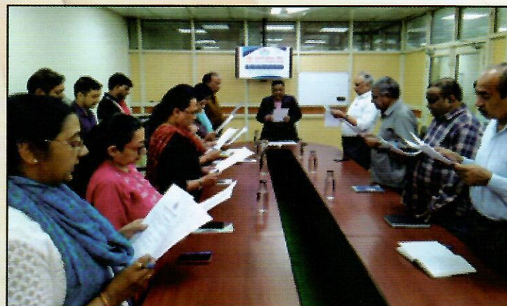
NCCT and Officers & Staff of NCCT (HQ) taking the pledge