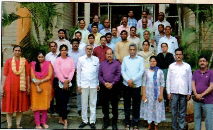
Group Photo of HDCM course