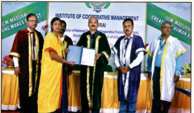
Glimpses of the MBA Convocation Ceremony