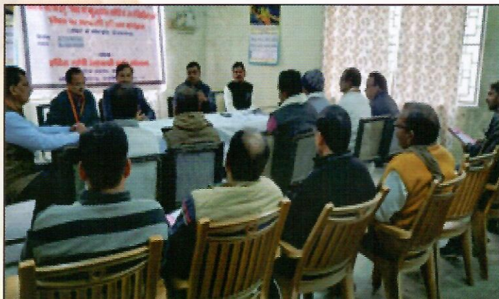
Glimpses of Training Programme for Districts of Uttar Pradesh under SOFTCOB Scheme of NABARD for the Secretary of PACS.