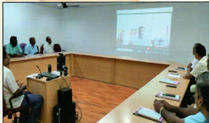
Glimpses of the programme on PACCS as MSCs for the Secretaries/Staff of PACCS