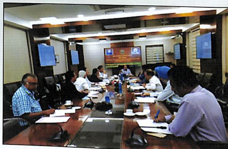
A view of the meeting on Model Bye-laws for PACS

A Meeting was convened under the Chairmanship of Secretary (Cooperation) on 15 th June, 2022 at 11.00 a.m. in the Ministry of Cooperation to discuss Model Bye-Laws for PACS. Ministry officials, members of the Committee and NCCT officials attended the meeting.