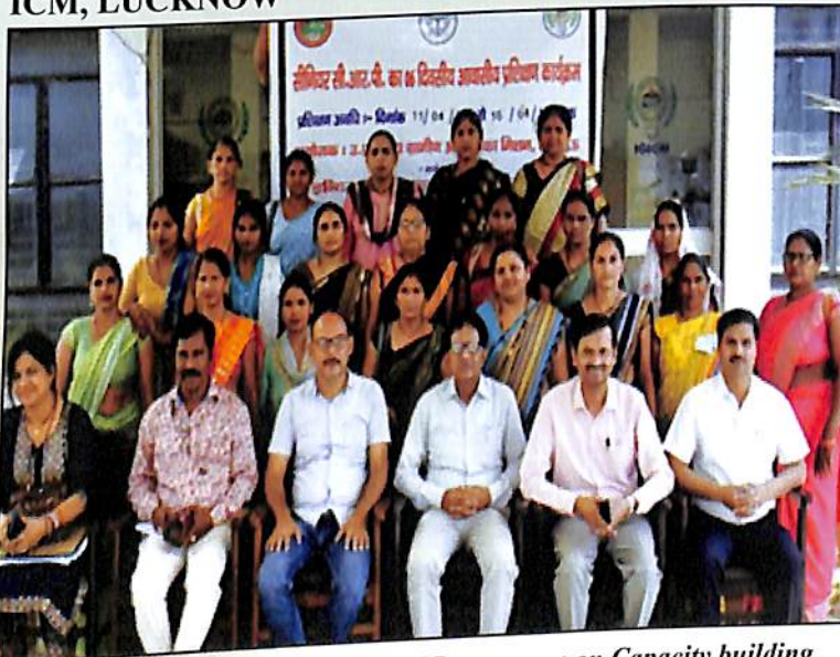
Group photo of the participants of Programme on Capacity building for Sr. CRP of UPSRLM