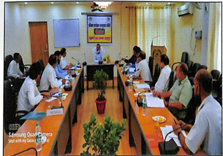
प्रशिक्षण कार्यक्रम सलाहकार समिति की बैठक का एक दृश्य