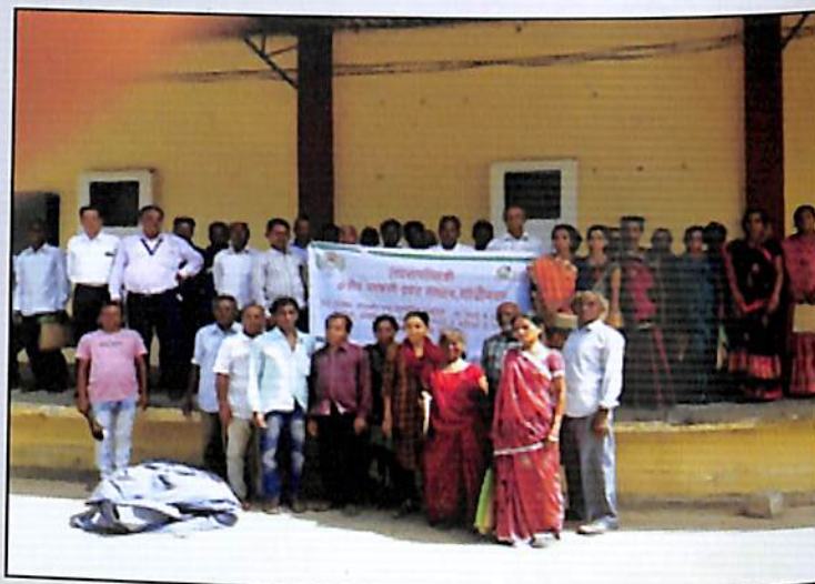
A glimpse of Farmers Awareness Programme organised by RICM, Gandhinagar in collaboration with WDRA on 6 th June, 2022