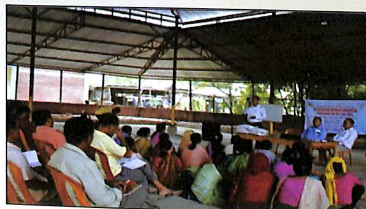
A view of the One Day Co-Operative Member Education Programme for PACS & SHGs organised by ICM, Imphal on 26.05.2022 at Kameng Community Hall, Imphal West