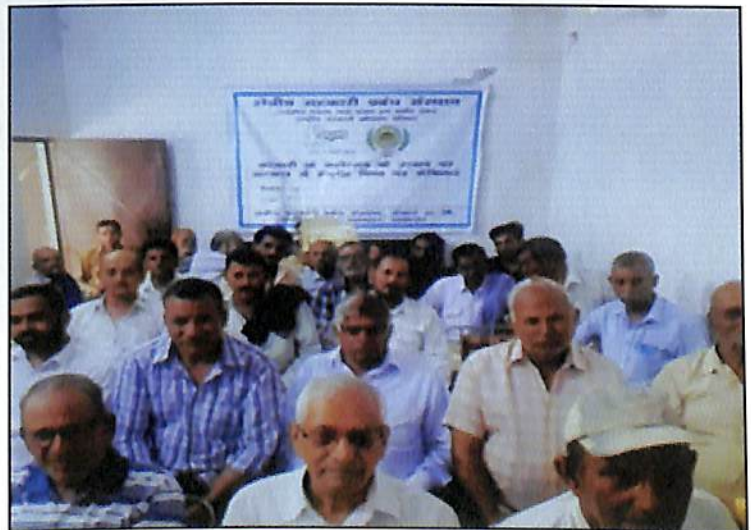
Glimpse of Seminar on Sehkar se Samridhi to celebrate Azadi ka Amrit Mahotsav