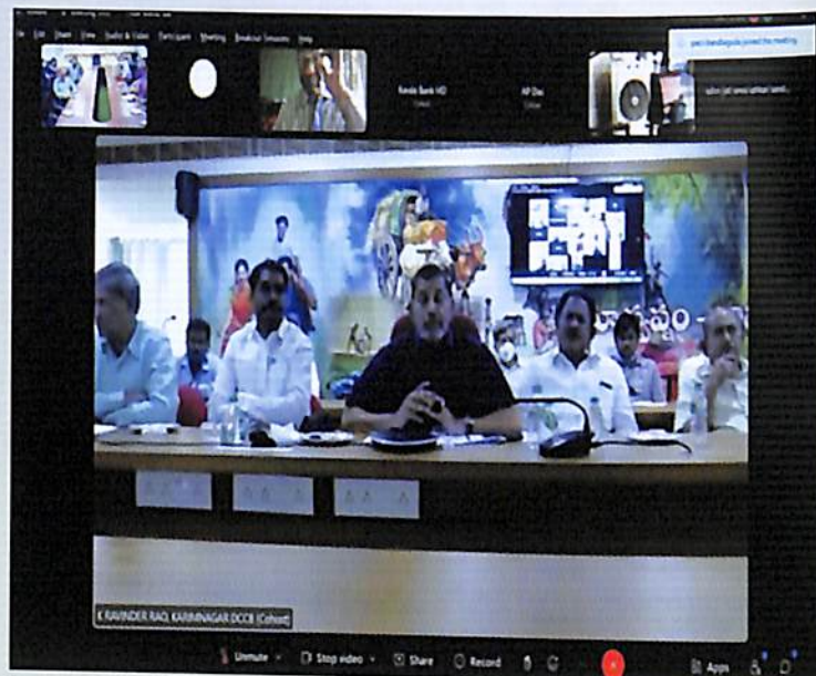
Screenshots of the High Level National Webinar on Rejuvenation of Primary Agricultural Cooperative Societies on the occasion of 75 th Year of Azadi Ka Amrit Mahotsav on 29 th April, 2022