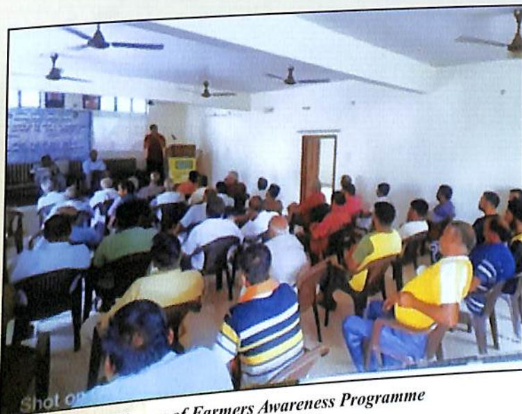
Glimpse of Farmers Awareness Programme