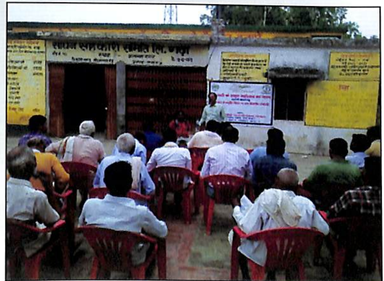
Glimpse of programme on Azadi Ka Amrit Mahotsav