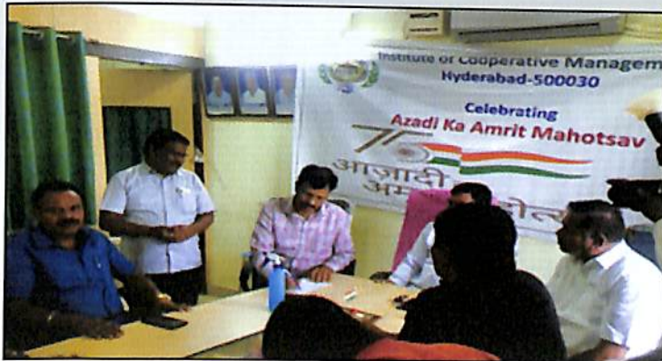
A view of the Seminar on Business Development at Upparpally PACS, to mark the occasion of 75 years of Azadi ka Amrit Mahostav at Rangareddy district, Telangana organised by ICM, Hyderabad on 28.4.2022