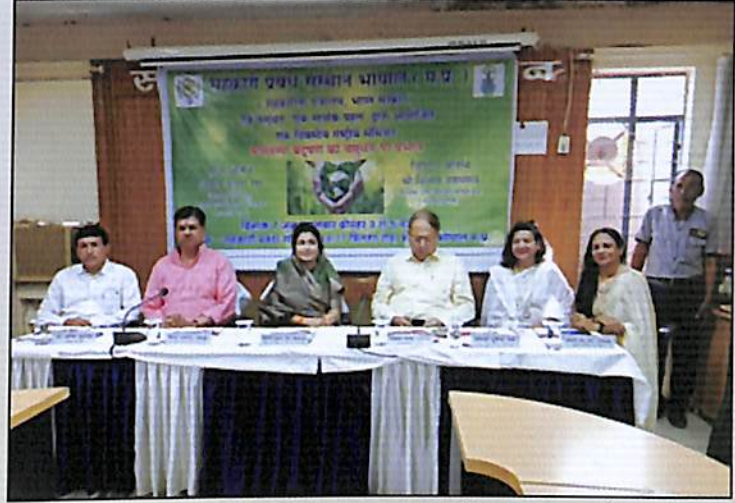
"पर्यावरण प्रदूषण का वसुंधरा पर प्रभाव" विषय पर कार्यशाला का एक दृश्य

संस्थान हिन्दी राजभाषा के अंतर्गत वसुंधरा एक सार्थक पहल, भोपाल के संयुक्त तत्वावधान मे "पर्यावरण प्रदूषण का वसुंधरा पर प्रभाव" विषय पर कार्यशाला दिनांक 07.06.2022 को आयोजित की गई, जिसमे 126 लोगों ने भाग लिया । कार्यक्रम में भाग लेने वाले समस्त जनों को एक – एक फलदार पौधा संस्थान द्वारा भोपाल वन विभाग के सहयोग से वितरित किया गया ।