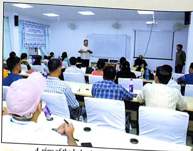
A view of the Induction Training Programme