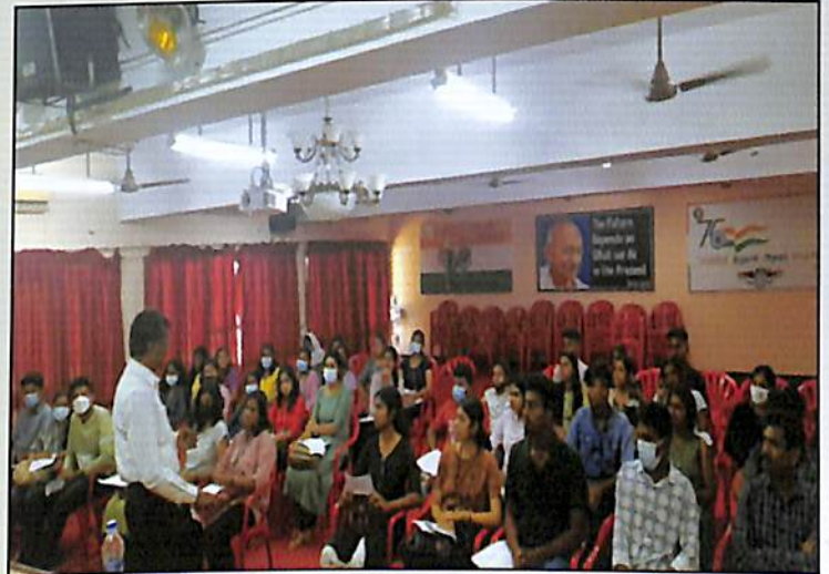
A view of Youth Awareness Programme conducted at ICM, Chennai on 14.06.2022