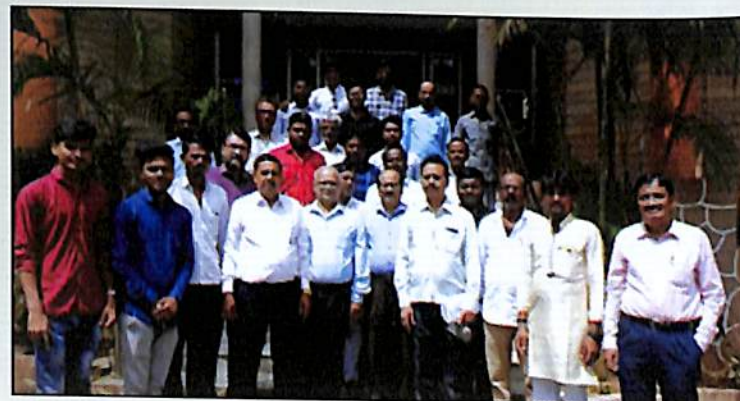
A Group Photo of the Programme on Cooperative Education organised by ICM, Hyderabad on 1.6.2022.