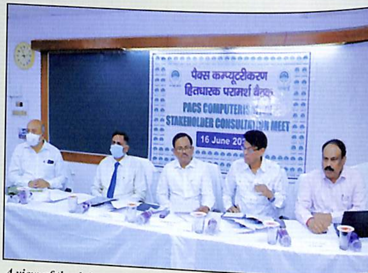
A view of the dais on the Stakeholder Consultation Meet Programme