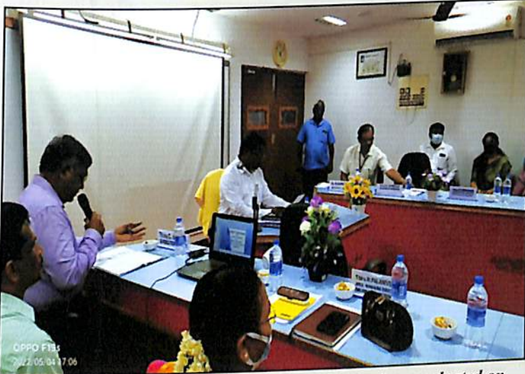
A view of Programme Advisory Committee Meeting conducted on 4 th May, 2022