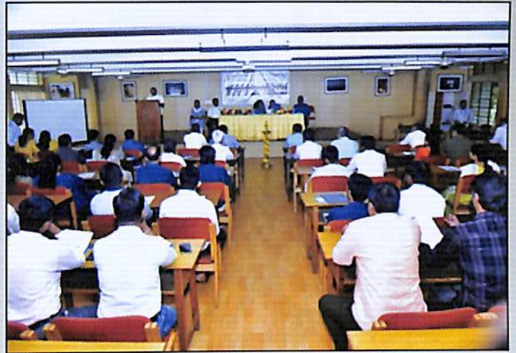
Management Development Programme for the Officers Serving in the Urban Cooperative Banks from 20 th June 2022 to 24 th June 2022 Class Room Photos