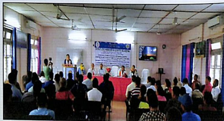
A view of Inaugural Function of District Level Workshop on Scientific Beekeeping on 6 th & 7 th April 2022 at KVK, Chirang, BTR, Assam sponsored by National Bee Board, New Delhi