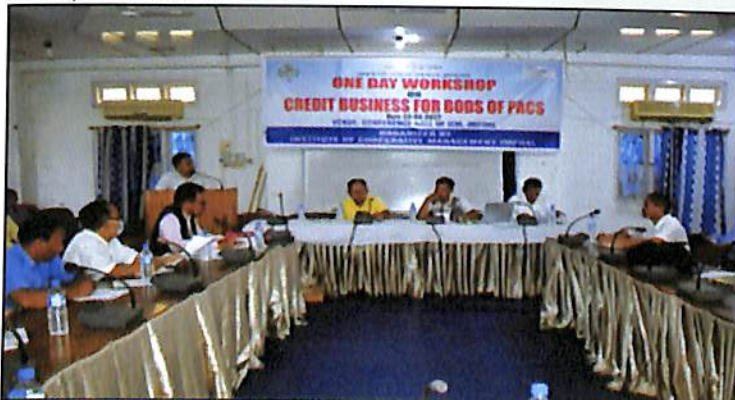
A view of the one day Workshop on Credit Business for BoDs of PACS organised by ICM, Imphal on 8 th April, 2022