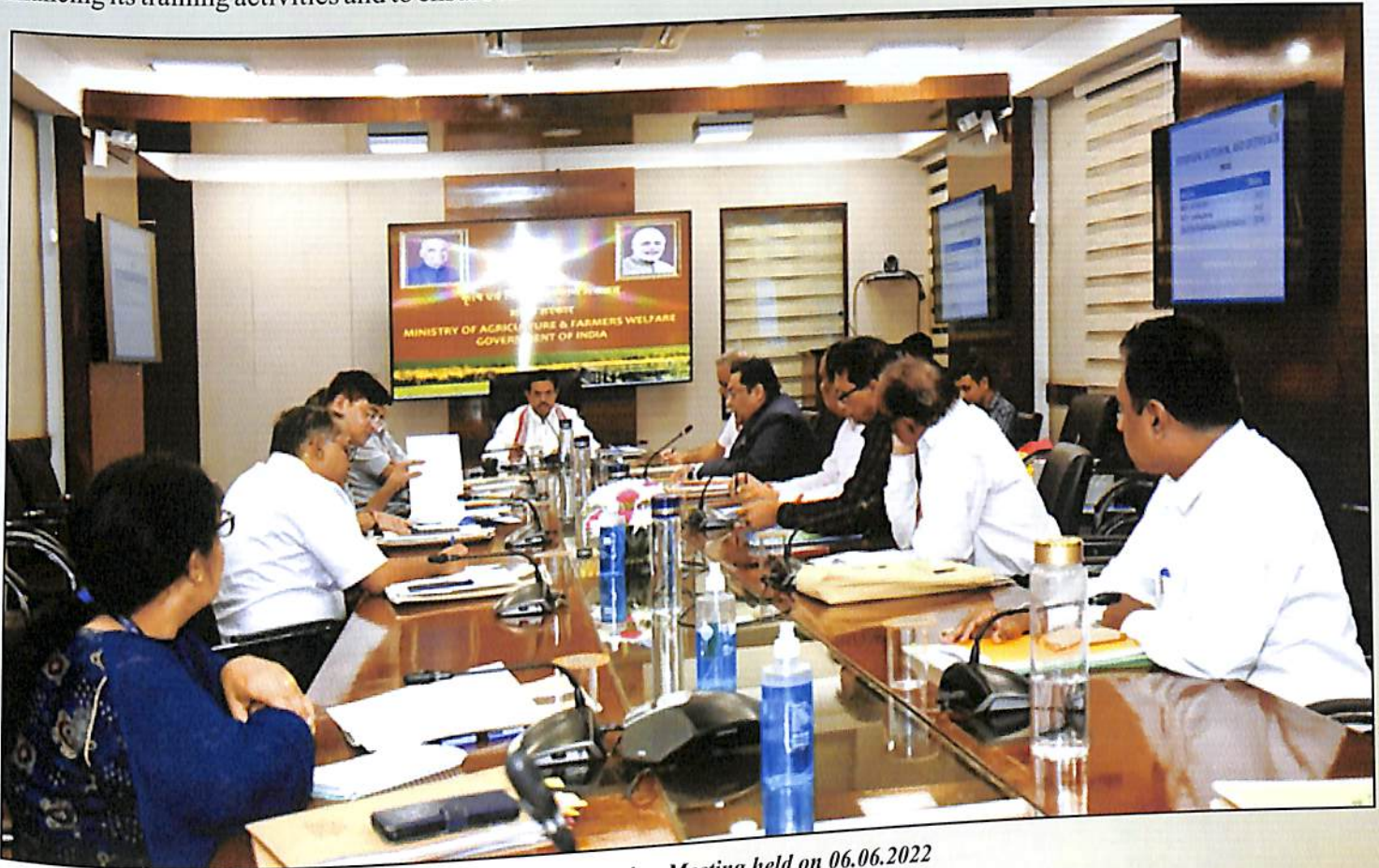
A view of the Review Meeting held on 06.06.2022

A Review Meeting on the Training Activities of NCCT and its Institutes was convened under the chairmanship of Shri B.L. Verma, Hon'ble Minister of State for Cooperation, Government of India on 6 th June, 2022 at 1.00 p.m. in the Ministry of Cooperation. At the outset the Secretary, NCCT welcomed the Hon'ble Minister and others including officers of the Ministry present in the meeting and gave a presentation on the activities carried out by the NCCT. Secretary, Ministry of Cooperation emphasized that NCCT should use technology effectively to increase its reach by conducting online training programmes. Shri B.L. Verma, Hon'ble Minister of State for Cooperation in his speech said that after the creation of this Ministry, it is the task before us to make prosperity through cooperative movement as a mass movement connecting the farmers, women, rural poor and youth of the village. He also emphasized that NCCT has to play an important role in enhancing its training activities and to ensure its reach to the grassroots level.