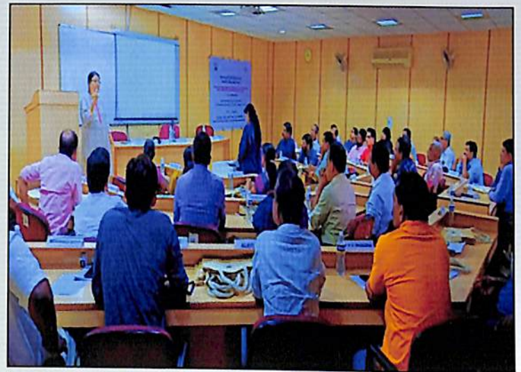
A view of the Leadership Development Programme

Leadership Development Programme for the Board of Directors and employees of PACs was held in collaboration with VAMNICOM, Pune at VAMNICOM campus during 11-14 May 2022. Altogether 41 participants attended the programme from 18 PACS of Kerala State. The participants of PACs are from Malappuram, Kozhikode and Kannur Districts. Board of Directors and Secretary from each of 18 PACs attended the programme.