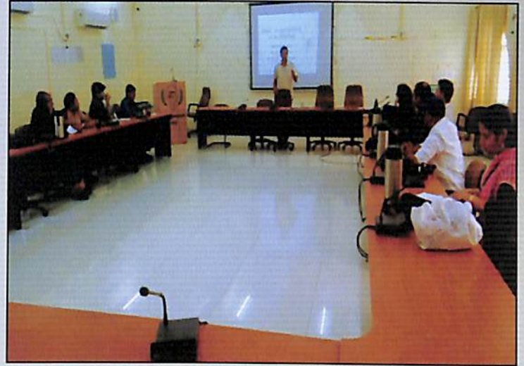
लेखा परीक्षा प्रक्रिया, लेखा प्रक्रिया और वित्तीय विवरण पर प्रशिक्षण कार्यक्रम का एक दृश्य

संस्थान सहकारी विभाग के लेखा परीक्षकों हेतु लेखा परीक्षा प्रक्रिया, लेखा प्रक्रिया और वित्तीय विवरण पर दिनांक 26 से 28 अप्रैल, 2022 प्रशिक्षण कार्यक्रम आयोजित किया गया। इस प्रशिक्षण कार्यक्रम में सहकारी विभाग के 16 लेखा परीक्षकों ने भाग लेकर सफलापूर्वक प्रशिक्षण प्राप्त किया।