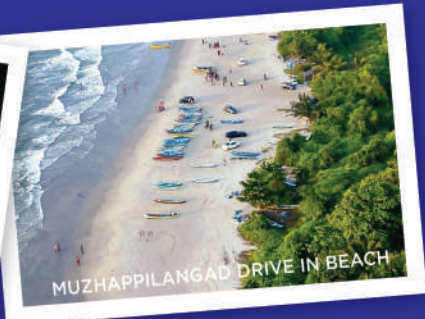
MUZHAPPILANGAD DRIVE IN BEACH