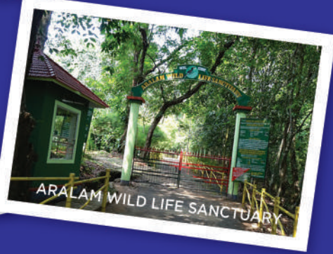
ARALAM WILD LIFE SANCTUARY