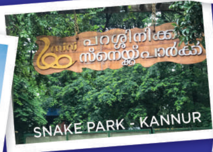
SNAKE PARK - KANNUR