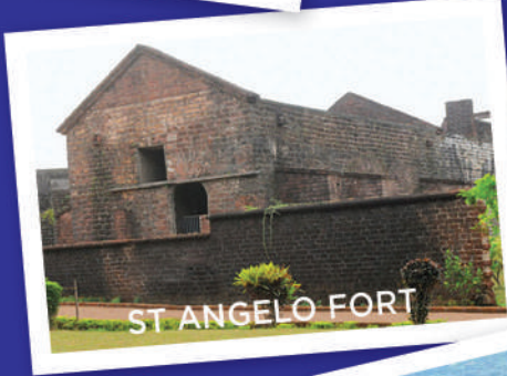
ST ANGELO FORT